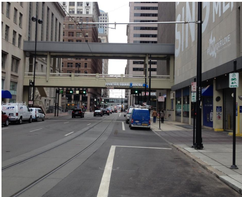
Photo below shows example on Walnut just south of Sixth Street.

Motorists are allowed to cross over single solid white lines with caution. You see these anywhere along the route with on-street parking. However, when parking, motorists must keep all parts of their vehicle completely within the white line, including side-view mirrors.