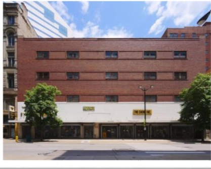
616 Race Street 43,520 SF Contact: Andrew Naab